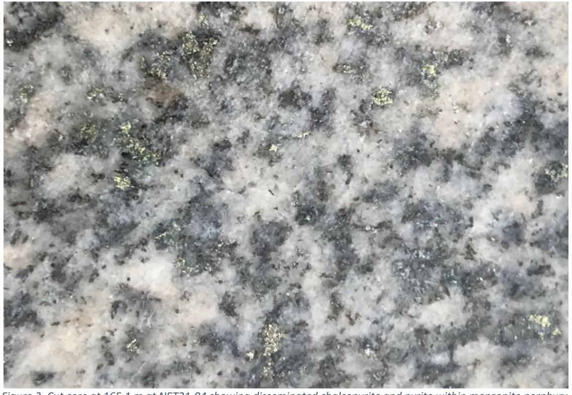
Figure 3. Cut core at 165.1 m at NET21-04 showing disseminated chalcopyrite and pyrite within monzonite porphyry.