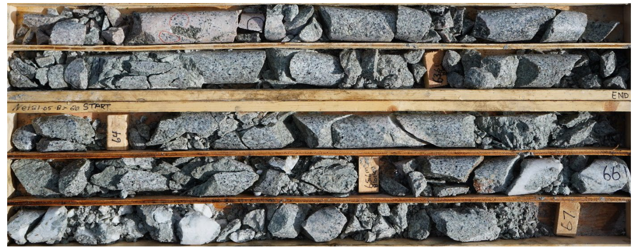
Figure 8. Core from 62.0 m to 67.0 m at NET21-05 showing the multiple sulfide quartz vein zone and intense potassic alteration in the granodiorite.