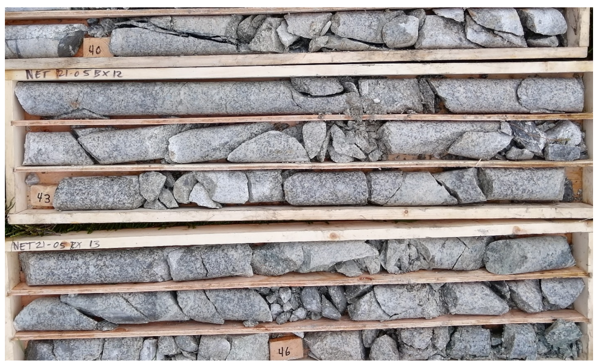
Figure 4. Core from 40 m to 46.6 m at NET21-05 showing sulfides monzonite porphyry dyke.