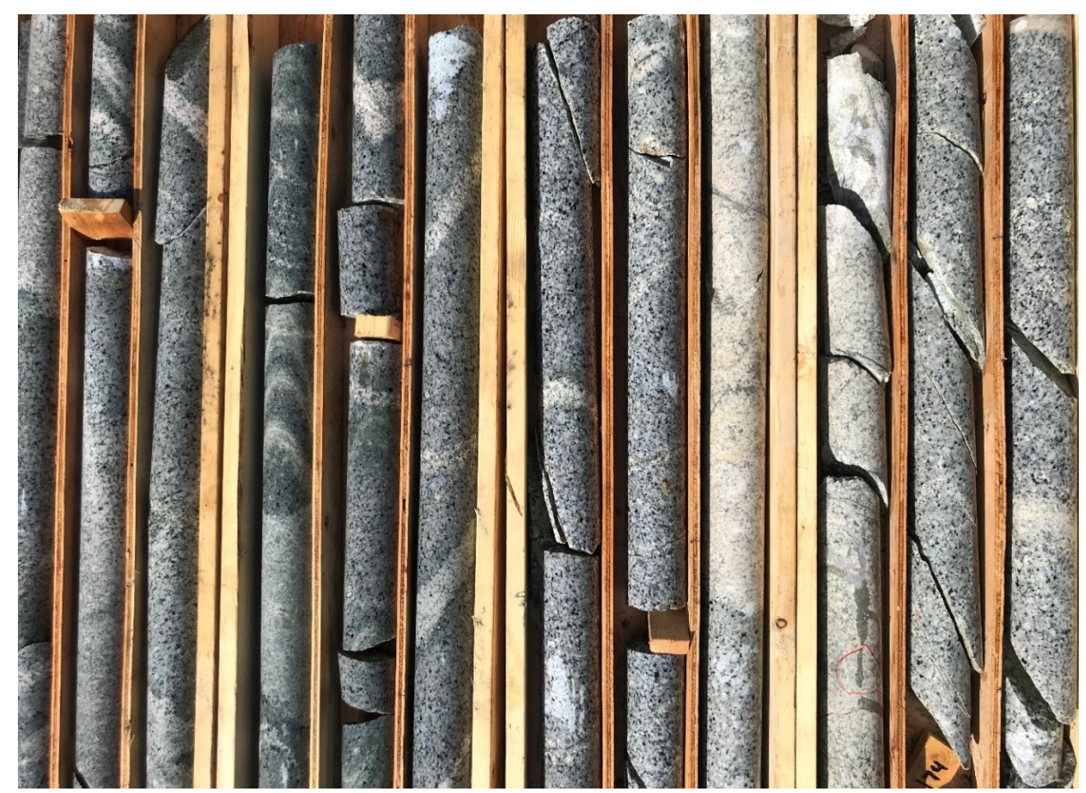
Figure 2. Core from 164 m to 176 m at NET21-04 showing multiple sulfides monzonite porphyry dykes and potassic alteration.