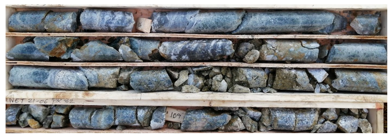
Figure 9. Core from 105.7 m to 109.5 m at NET21-06 showing the strong altered sulfide quartz breccia veining zone in the granodiorite.