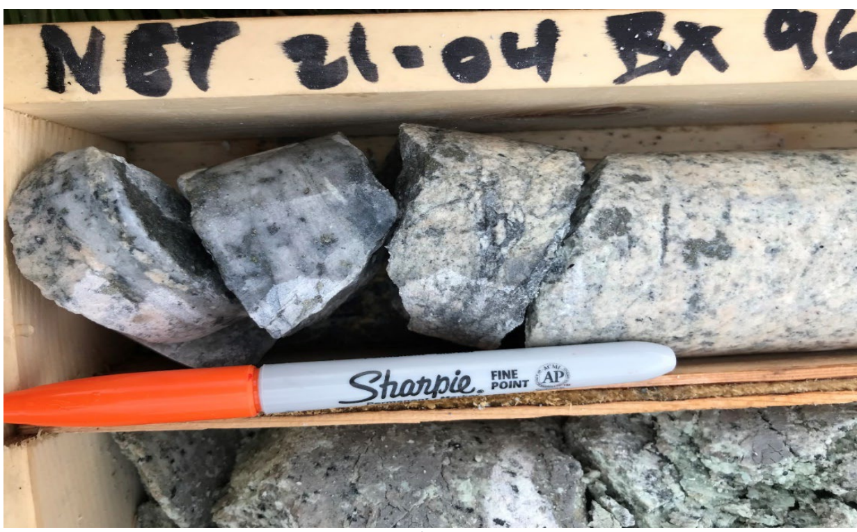
Figure 7. Three spot counts at 316.8 m returned over 296 g/t Ag, 6000 ppm Cu, 2300 ppm Sb and 950 ppm Zn, mainly from tetrahedrite and chalcopyrite.