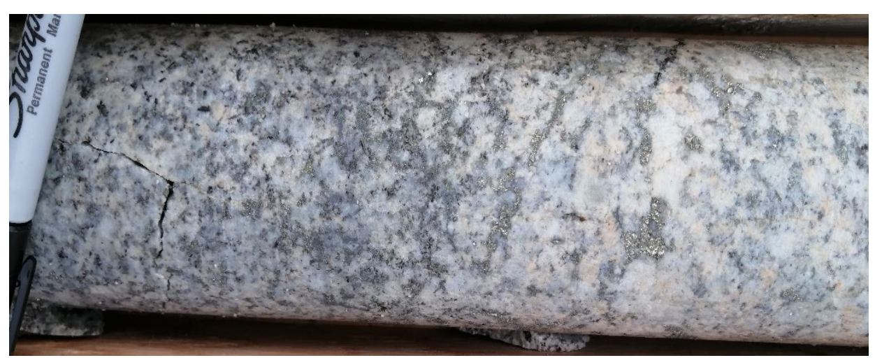
Figure 5. Core at 41.0 m to 41.2 m at NET21-05 showing disseminated chalcopyrite and pyrite within strong altered monzonite porphyry.