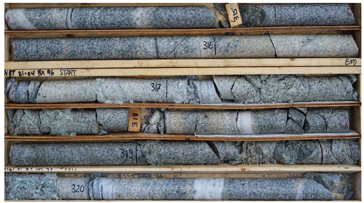
Figure 6. Core from 314.4 m to 320.8 m at NET21-04 showing the multiple sulfide quartz vein zone and intense potassic alteration in the granodiorite.