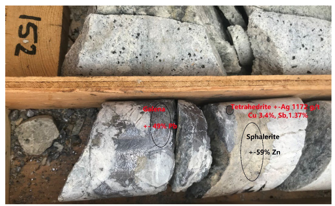
Figure 2. 10 cm thick massive galena-sphalerite-tetrahedrite-chalcopyrite vein at 151 m to 151.10 m from NET21-01. XRF testing shows high-grade Ag-Cu-Sb-Pb-Zn mineralization.