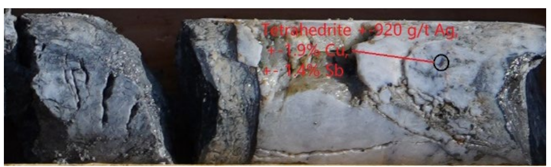
Figure 3. Core at 27.8 m from NET21-02 shows high-grade Ag-Cu-Sb. Portable XRF analyzer reported Ag grades of up to 920 g/t from the tetrahedrite mineral.