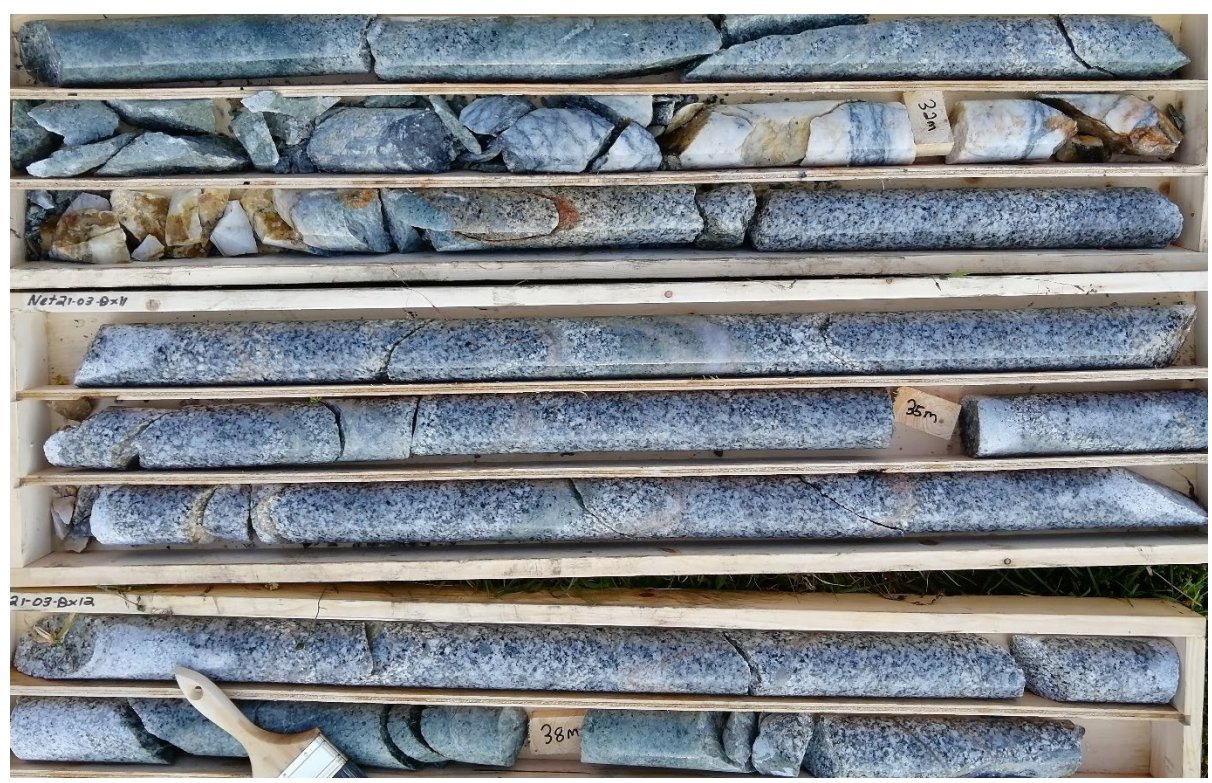
Figure 7. Core at 31.7 m to 38.2 m from NET21-03 shows high-grade Ag-Cu. Portable XRF analyzer reported Ag grades of up to 156 g/t, Cu grades of up to 0.8% from tetrahedrite and other sulfides minerals.