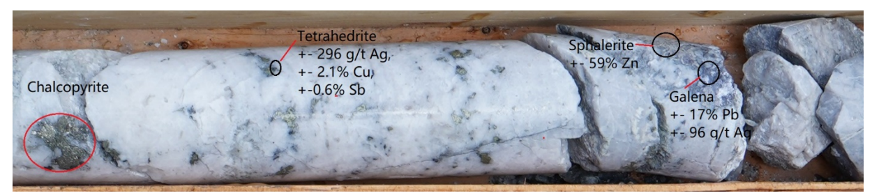
Figure 5. Core at 155.3 m to 155.6 m from NET21-02 shows high-grade Ag-Cu-Sb-Zn-Pb. Portable XRF analyzer reported Ag grades of up to 296 g/t, Cu grades of up to 2.1% from the tetrahedrite, 59% Zn from Fe-poor sphalerite and 17% Pb from mainly galena minerals.