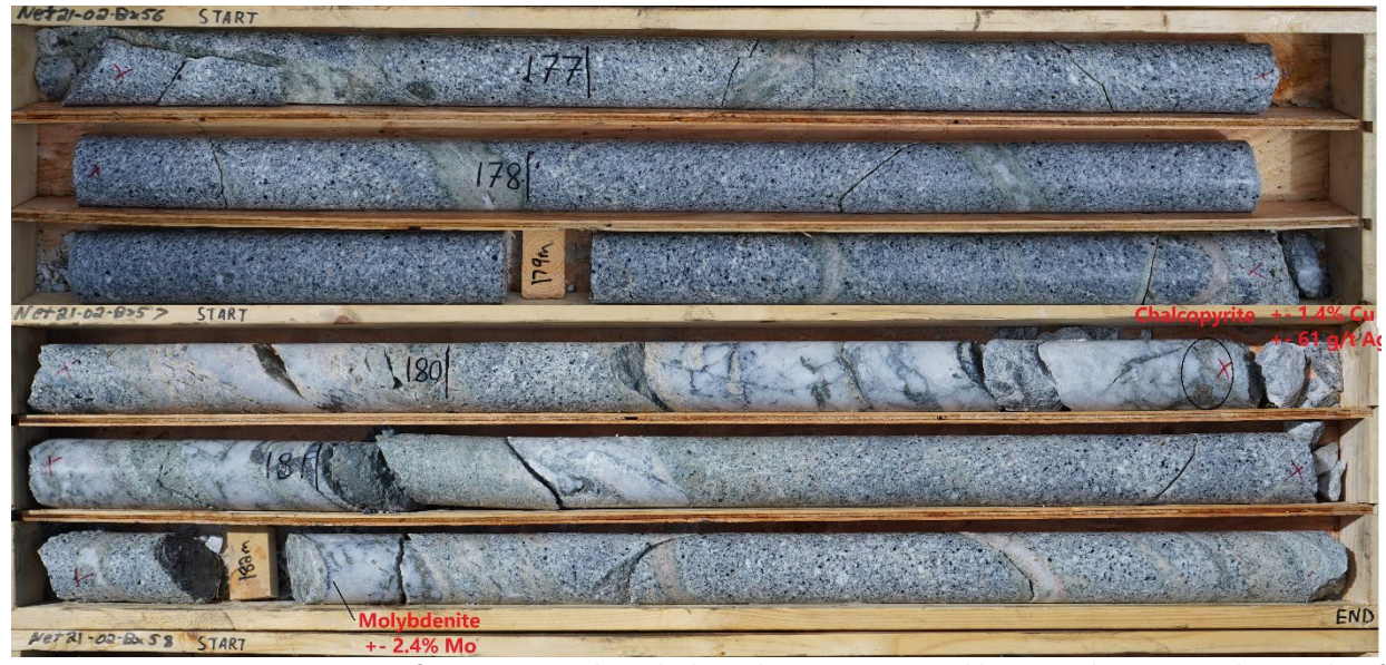
Figure 6. Core at 176.7 m to 182.8 m from NET21-02 shows high-grade Ag-Cu-Mo. Portable XRF analyzer reported Ag grades of up to 61 g/t, Cu grades of up to 1.4% from chalcopyrite and 2.4% Mo from molybdenite minerals.