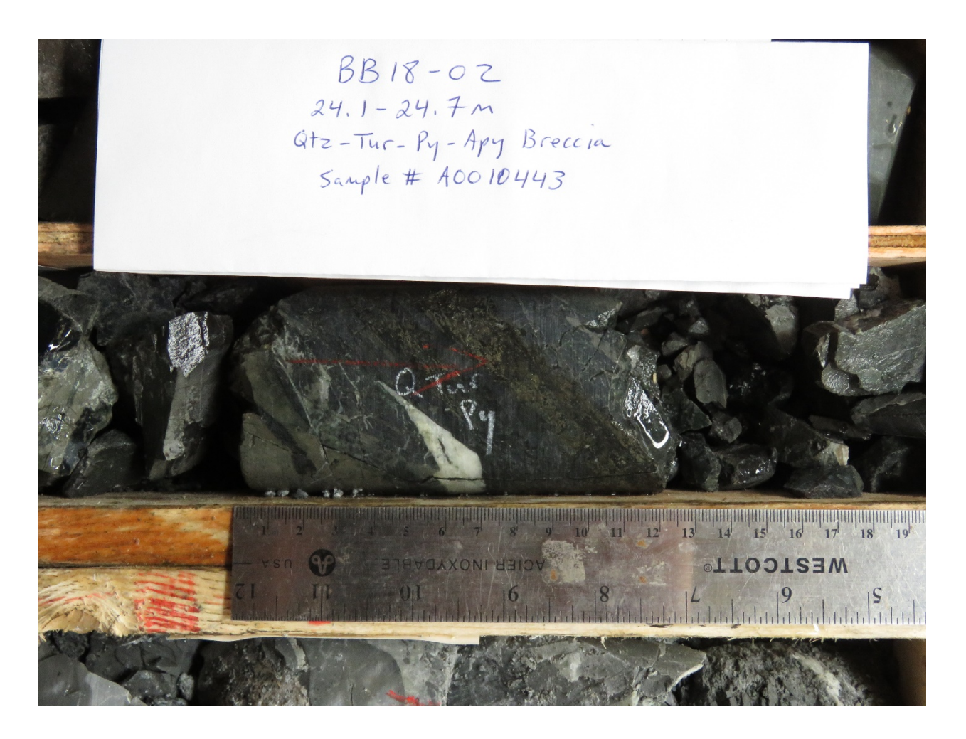
Figure 3 – Segments from 24.1 to 24.7 meters of drill cores from BB18-02 at Jaxon's Red Springs, which shows very strong silicified and sulphide mineralization.

Tony Guo, Jaxon's COO, commented: "We have an early, excellent and confirmatory result. The third drill hole, BB18-03, has intercepted areas with thicknesses of up to 26.3 metres, showing the same type of very strong silicified and sulphide tourmaline breccia mineralization as exposed in our earlier channel sampling program. BB18-03 also confirms the dip extension of the tourmaline breccia neralization at Channel E and demonstrates the zone's continuity along 295 metres of strike. Should the Company receive positive assay results in the range of the channel sample assay results we have already published, we will we have outlined a major discovery that is open along over 1,000 metres of strike and that is part of a much larger porphyritic system."