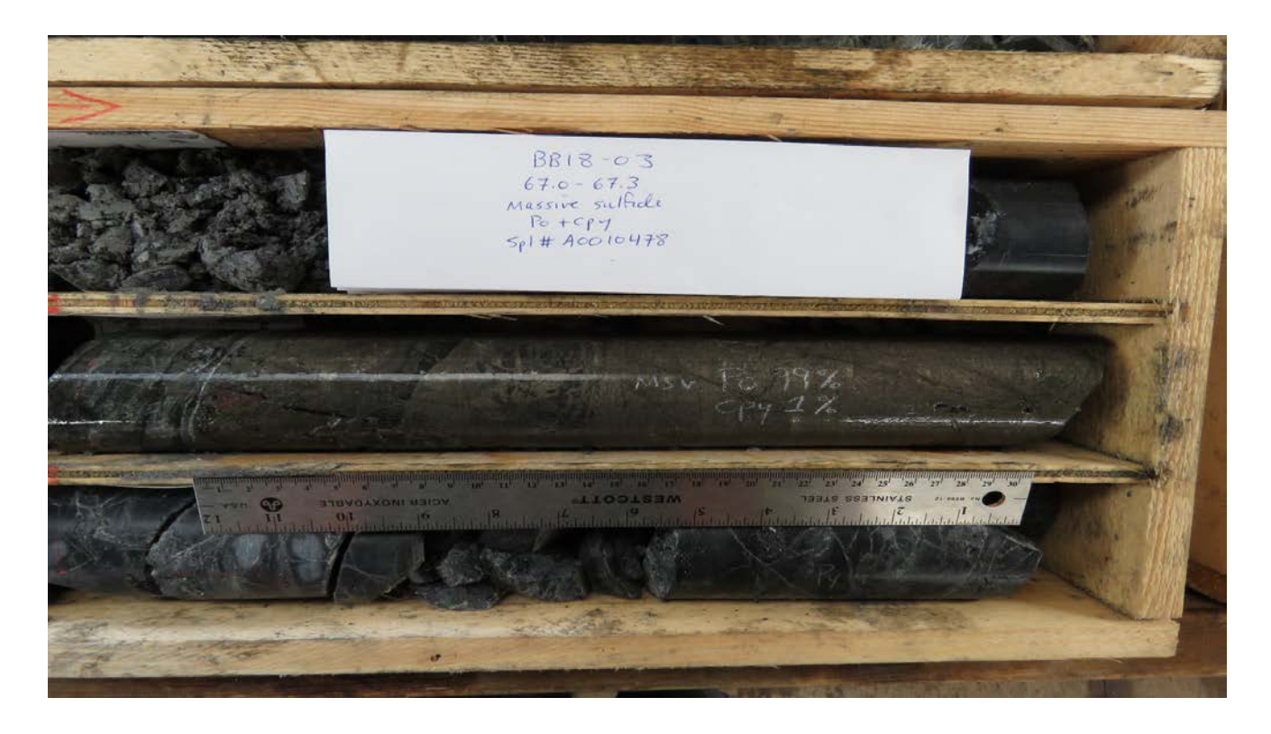
Figure 1 – Segments from 67.0 to 67.3 metres of drill cores from BB18-03 at Jaxon's Red Springs project, which shows very strong silicified and sulphide mineralization.