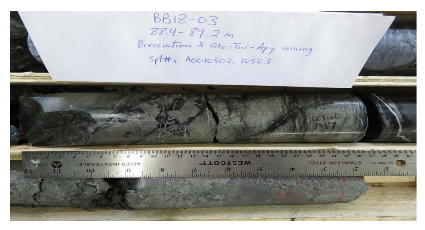
Figure 2 – Segments from 88.4 to 89.2 metres of drill cores from BB18-03 at Jaxon's Red Springs, which shows very strong silicified and sulphide mineralization.

Figure 1 – Segments from 67.0 to 67.3 metres of drill cores from BB18-03 at Jaxon's Red Springs project, which shows very strong silicified and sulphide mineralization.