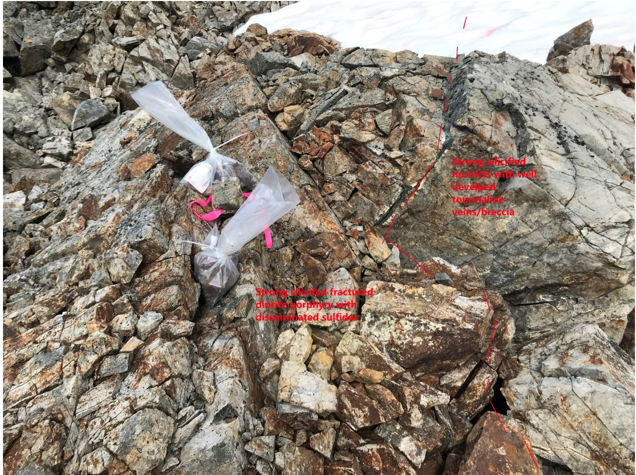
Figure 2. Hornfels with Tourmaline Veins and Diorite with Disseminated Sulfides