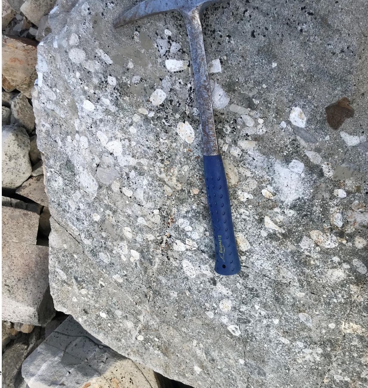
Figure 3. Hydrothe