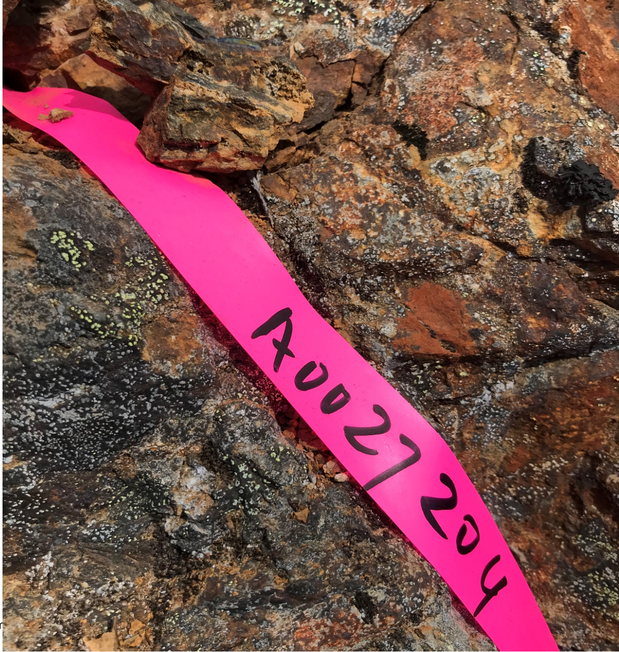
Figure 4. Tourm